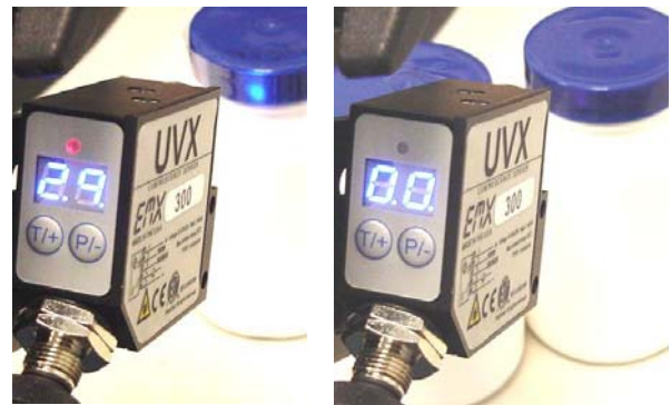
Tamper seal present Tamper seal missing

The photos show the UVX300 sensor viewing a pharmaceutical product with and without the tamper evident seal. The display shows the signal level from the optical brighteners in the seal, the red LED indicates that the signal is above the threshold setting. The fast response of the UVX300 allows detection of up to 3000 units/second making it ideal for high-speed packaging applications. The UVX300 provides the reliability necessary to assure each and every product is properly secured with the tamper evident seal.